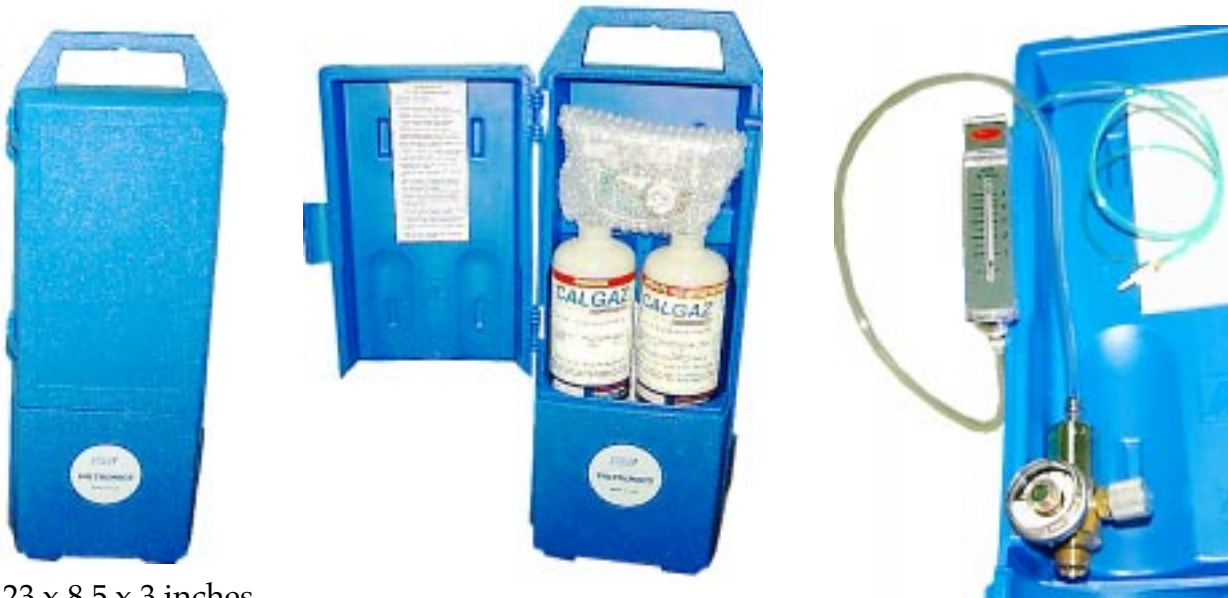
23 x 8.5 x 3 inches

0 to 500 ml / minute flow meter , tubing , tubing connector , pressure regulator and flow valve