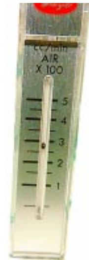
0 to 500 ml / min (cc/ min) flow meter

Model 2005SPI-2 Digital CO 2 sensor with RS232 test board connected to any PC com port using a terminal emulation program like HyperTerminal that come with Windows.